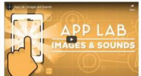
Video: App Lab - Images and Sounds