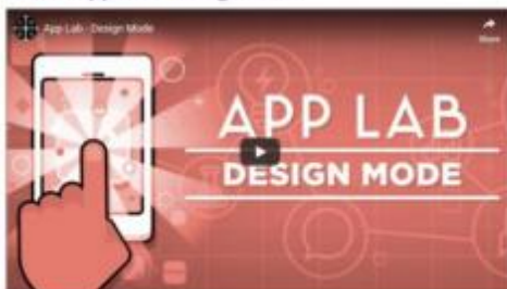
Video: App Lab - Design Mode