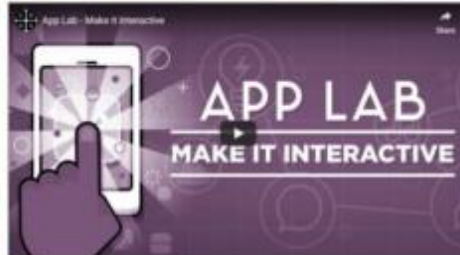
Video: App Lab - Make It Interactive