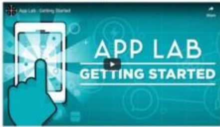
Video: App Lab - Getting Started